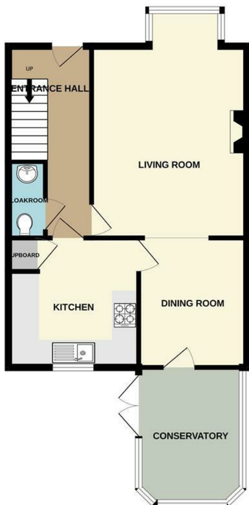
GROUND FLOOR 606 sq.ft. (56.3 sq.m.) approx.